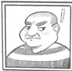
Person we don't know